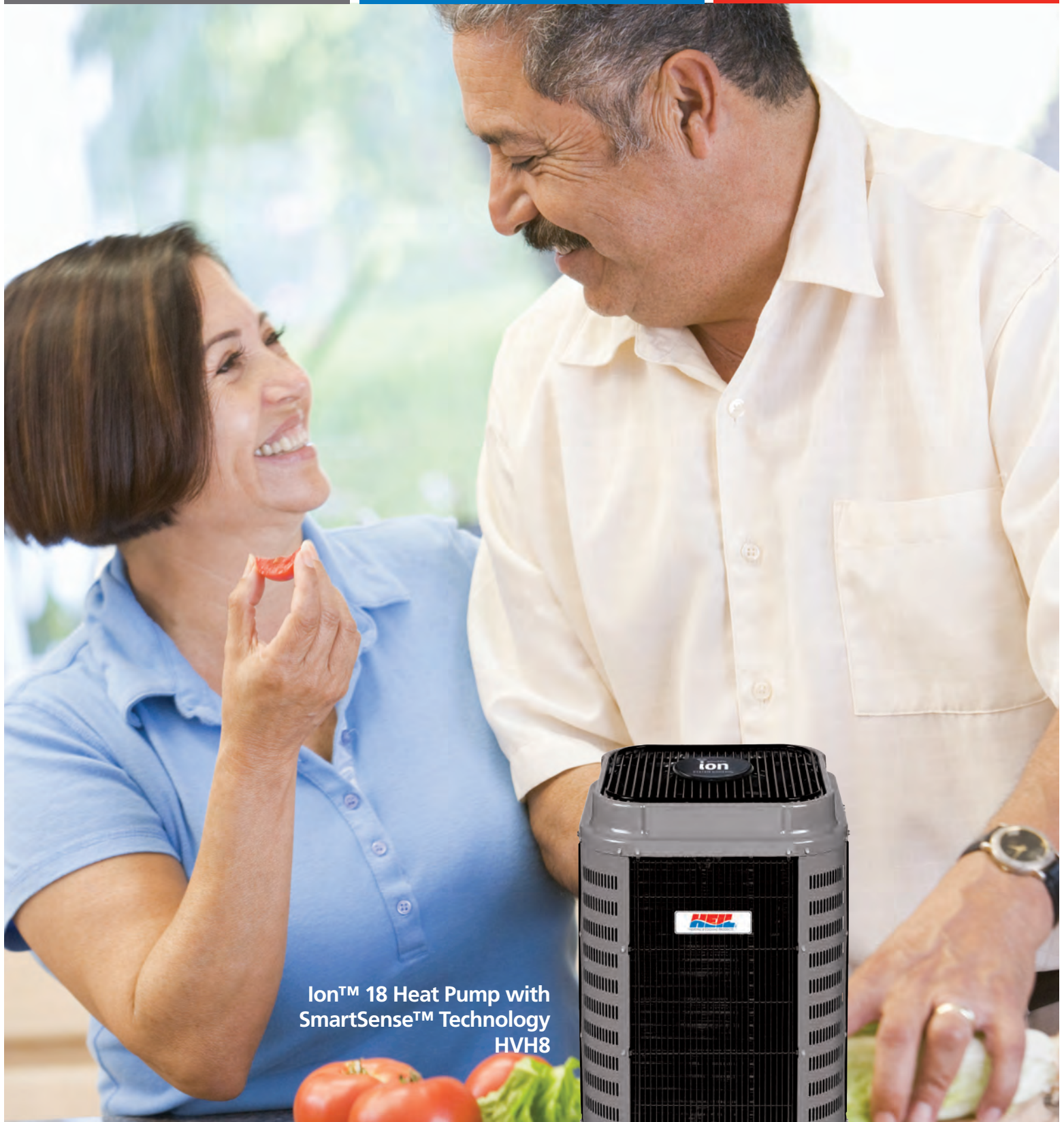
Ion™ 18 Heat Pump with SmartSense™ Technology HVH8