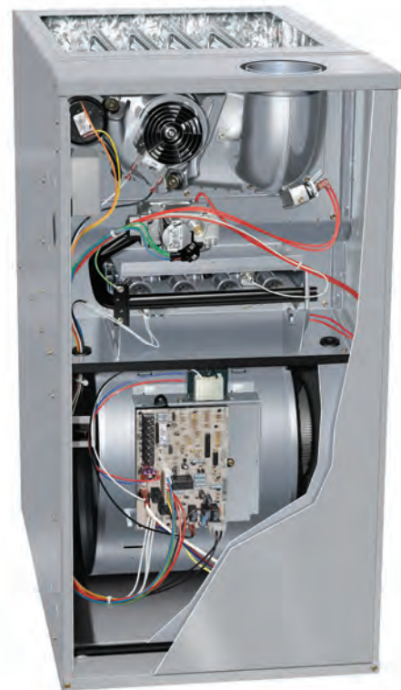
N80 Gas Furnace

* To the original owner, Heil products are covered by a 10-year parts limited warranty upon timely registration. The limited warranty period is five years if not registered within 90 days of installation except in jurisdictions where warranty benefits cannot be conditioned upon registration. See warranty certificate for complete details.